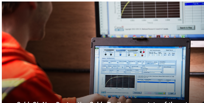
CableQ's Non-Destructive Cable Testing uses state-of-the-art technology to determine cable condition while maintaining the health of the cable.

The success of the rejuvenation program spurred Elexicon to refine this program further by adopting the Non-Destructive Cable Testing offered by CableQ as one of several measures to determine which cable to inject or replace. By adding cable testing to the formula, Elexicon predicts a reduction cost of cable injection due to more information about the cables and the area they are injecting.